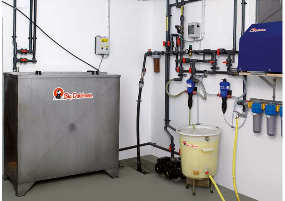
Service room with small (60 l) and large (1000 l) stainless steel medicine mixing tank

Liquid medicines are extracted directly from their original packaging. In case of pulverized or viscous materials, a medicine mixing tank with a rotary vane pump (60, 180 or 210 l) should be used.