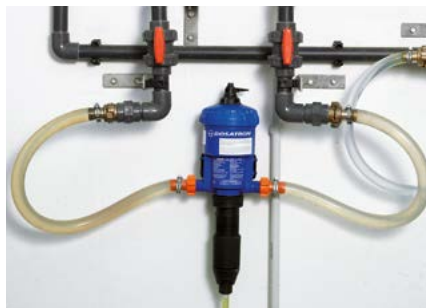
Medicator type 1