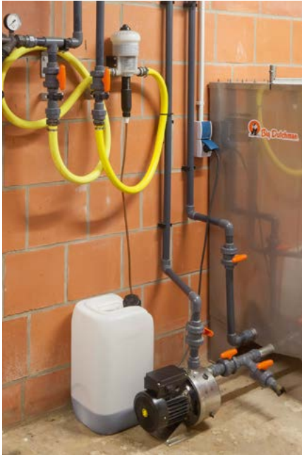
Liquid medicines are sucked in directly